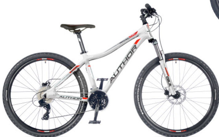
| RIVAL ASL [A] |