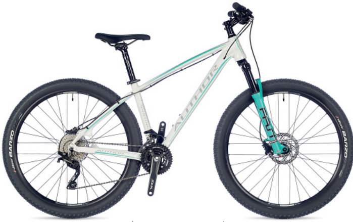
| INSTINCT ASL |