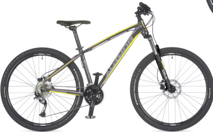
| PEGAS ASL [A] |