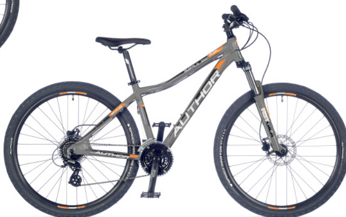
| IMPULSE ASL [B] |