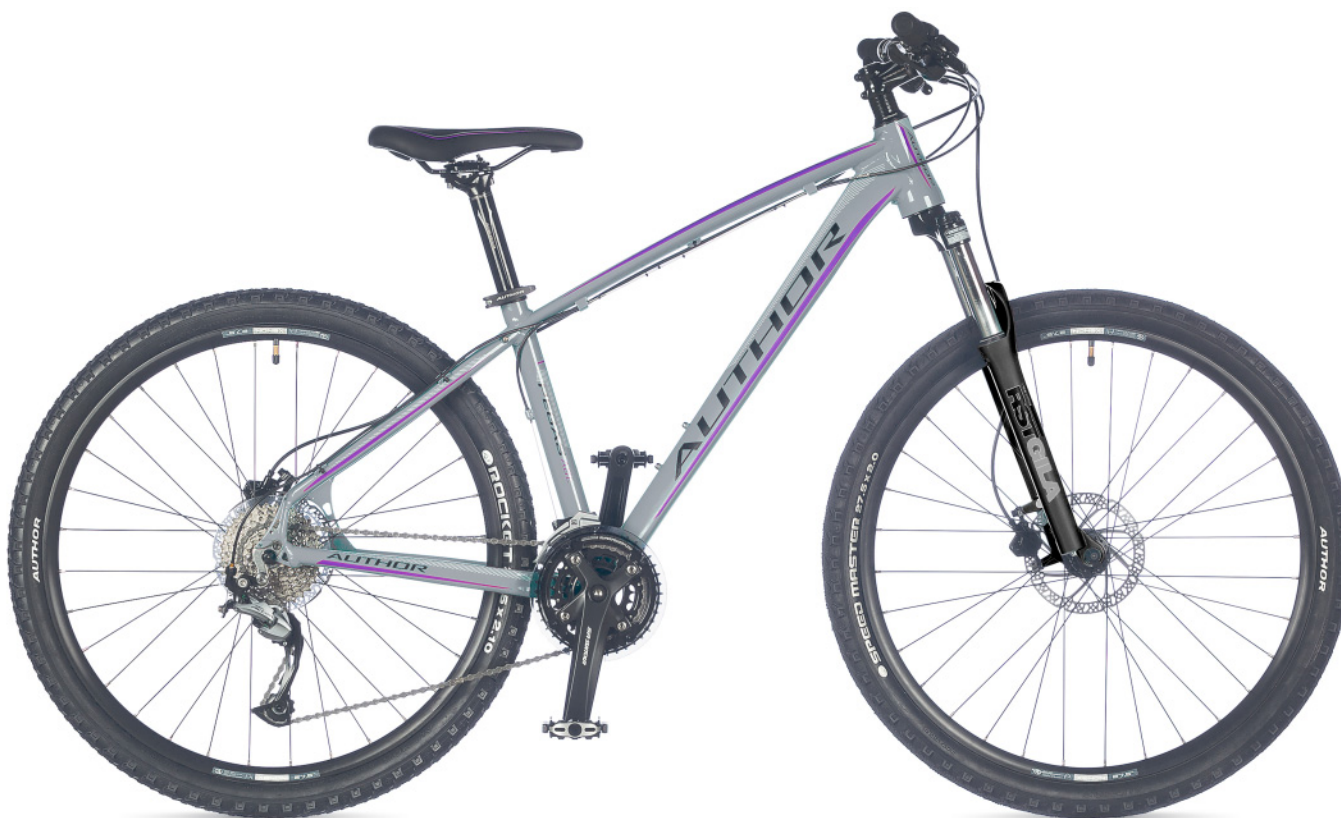
| PEGAS ASL [B] |