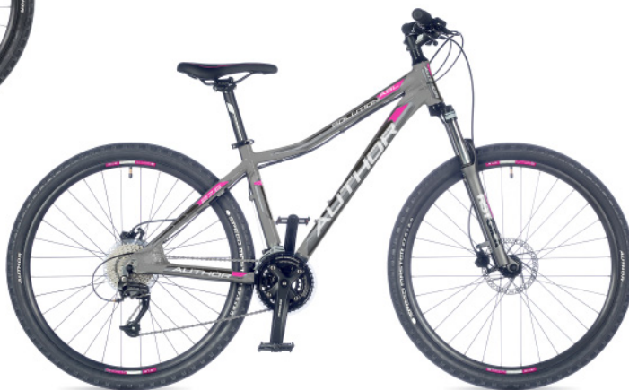
| SOLUTION ASL [B] |