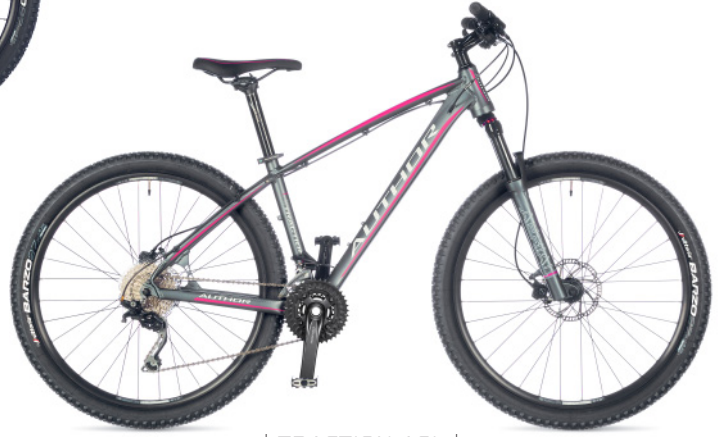
| TRACTION ASL |