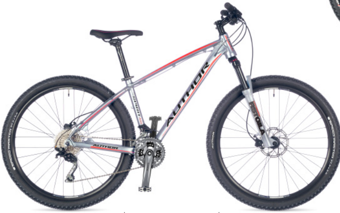
| SPIRIT ASL [A] |