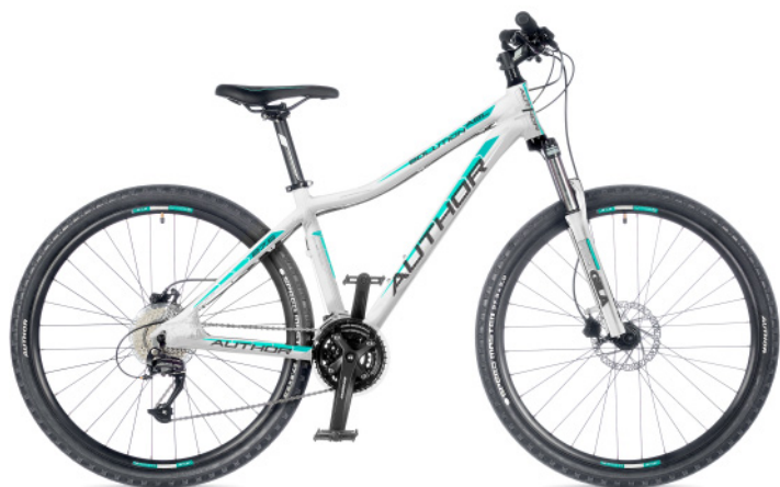
| SOLUTION ASL [A] |