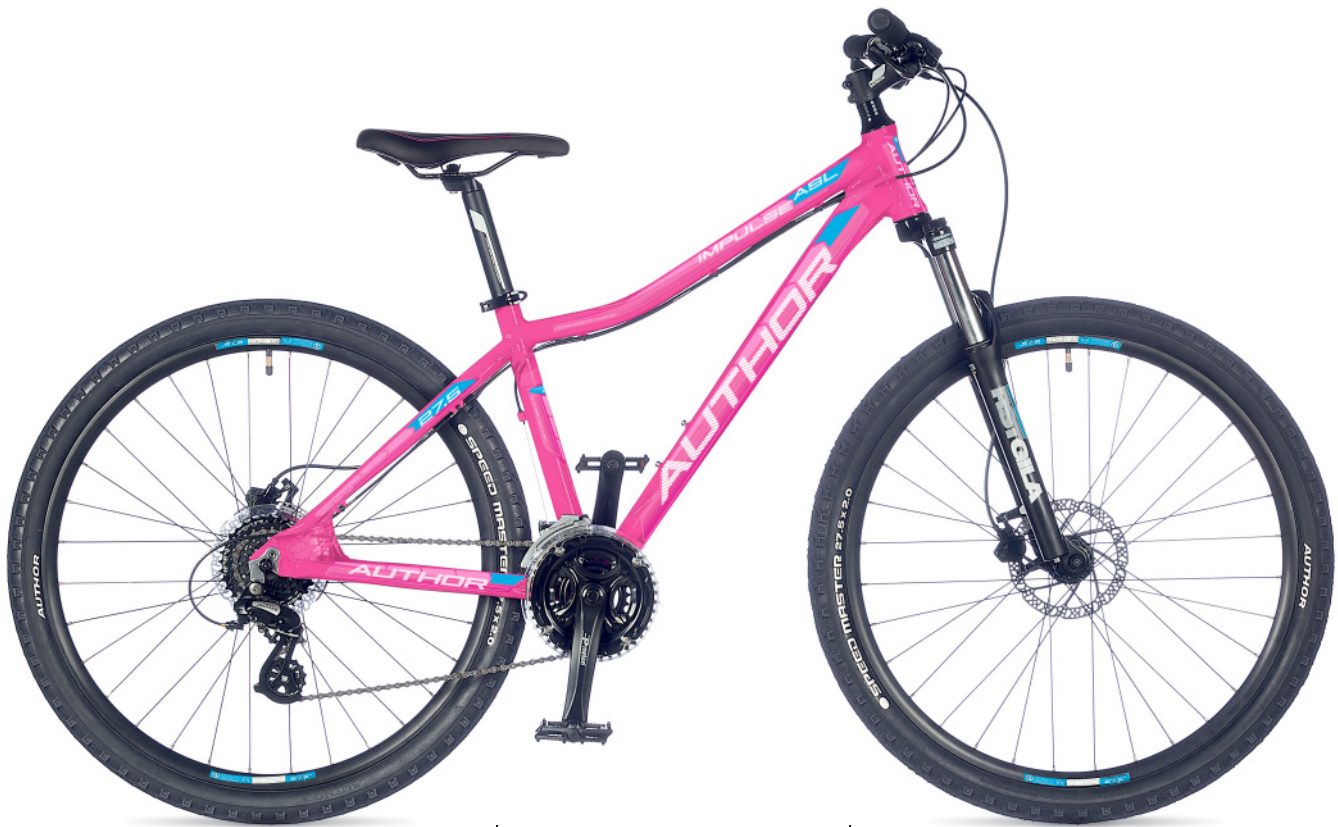
| IMPULSE ASL [A] |