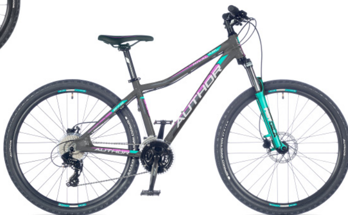
| RIVAL ASL [B] |