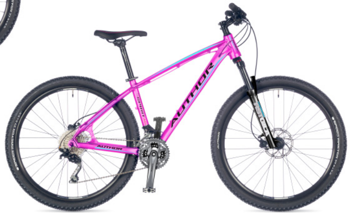
| SPIRIT ASL [B] |